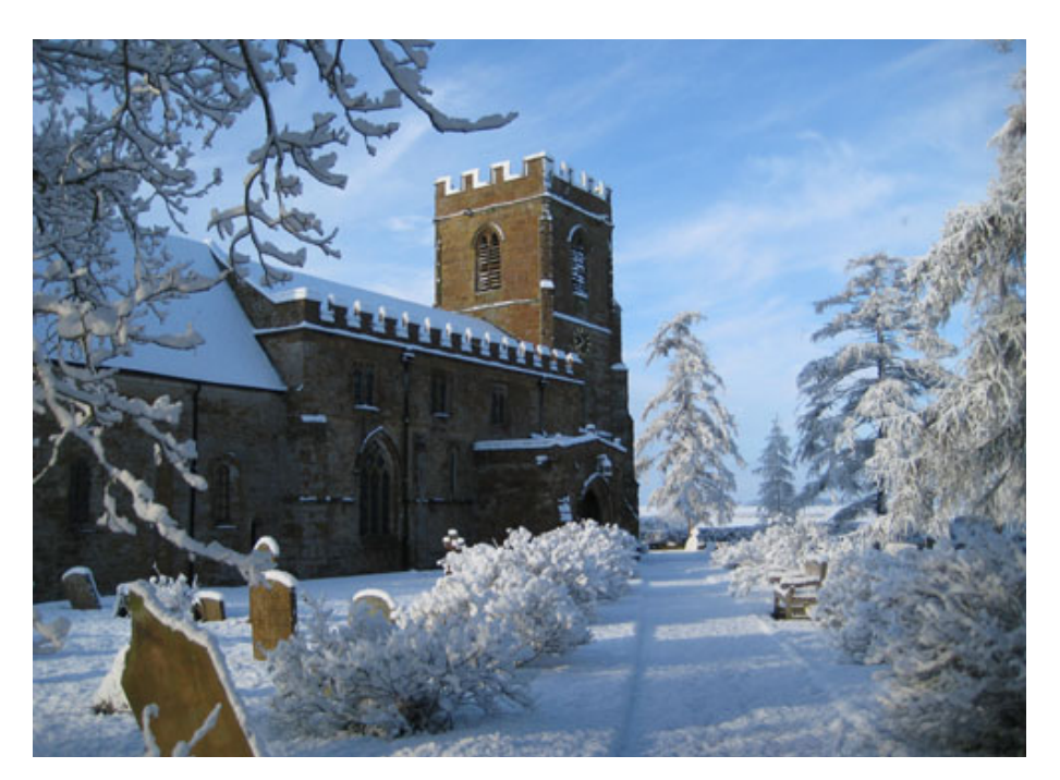
Be Part Of It

The 2017 St Lawrence Electoral Roll comprises 40 persons – not a large number considering the general regard in which the Church is held by those residing in the village.