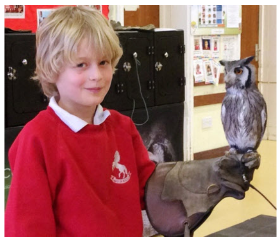
A White-faced Scops Owl