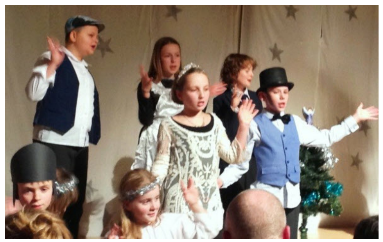
KS2 Perform How Christmas Came To Be

We celebrated Christmas with an exciting range of events including a special nativity, 'Behind the Stable Door' which was led by the younger children dressed as animals. The performance by the older children set out to teach the audience 'How Christmas Came to be'. It explained how some Christmas customs arose, starting with the Romans and continuing through history, via the Victorians, to the present day. The children also enjoyed the pantomime in the village hall. This year it was Old King Cole performed by the West Midlands Travelling Theatre Company. The children were fully entertained by the production and there was plenty of audience participation too. Oh yes there was!