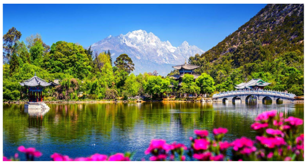
The Black Dragon Pool Park, Lijiang

He showed slides of breathtaking mountain and lowland scenery that hosts species of flora some 400 times as diverse as may be found in this country. It would seem that rather than search for plants in China one needs to be careful not to trip over them!