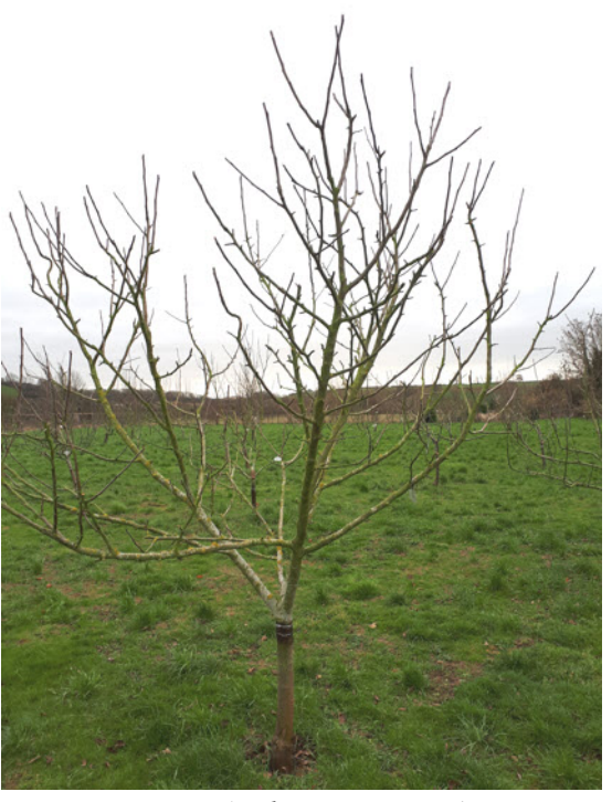
Pixie Apple post pruning!

Do come along to see us, maybe help out, and enjoy your community orchard behind the allotments along the Shenington Road in Tysoe! Why not join us and enjoy the fruit we grow.