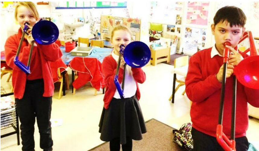
Children Playing The P-Trombone