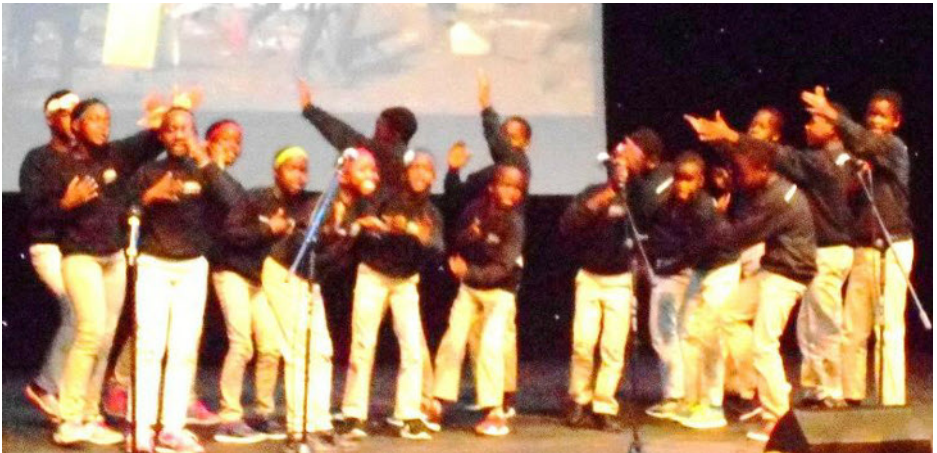
African Children's Choir at Rehearsal

It has been a busy and eventful half-term. Music has featured highly and many of our children (53% of our Year 2 - 6) now have instrument lessons in school, including for piano, drums, guitar, violin and trombone. The Year 6 children performed with the famous African Children's Choir on stage in the Leamington Spa Theatre. It was a fantastic experience to be part of such a large and exuberant choir.