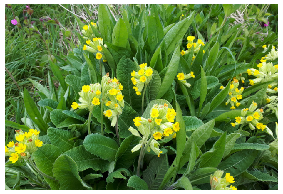
Cowslips doing well

blossom has appeared on many of the apple trees and some of the pears. The Bramley apples have had their best show of blossom for a few years so that is positive! There is no sign of any plums, greengages or damsons which is such a shame after last year's promising harvest.