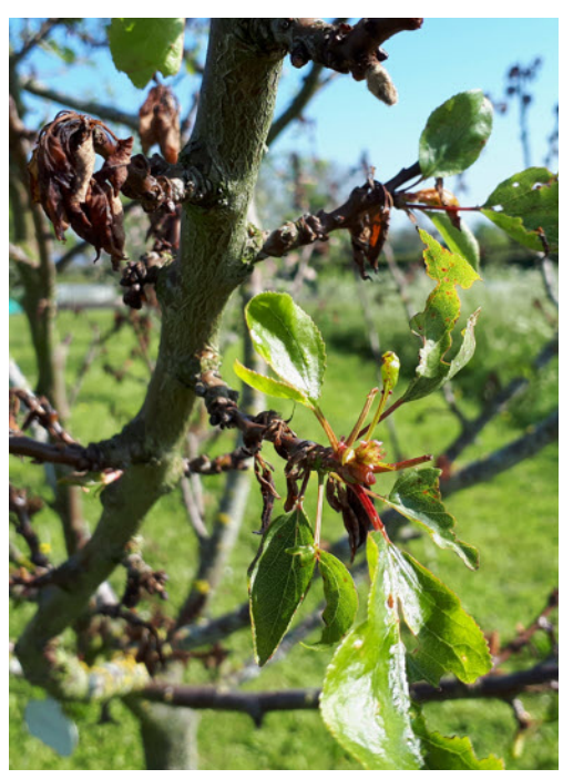
New Foliage on Apricot in May