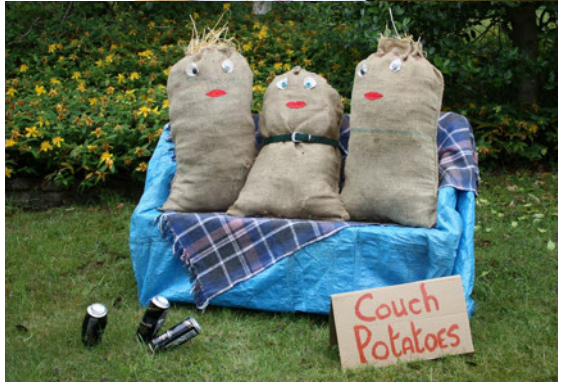
Scarecrows from our 2017 Scarecrow Festival

Lucy Mercer 07531 136136 lucymercer@hotmail.co.uk