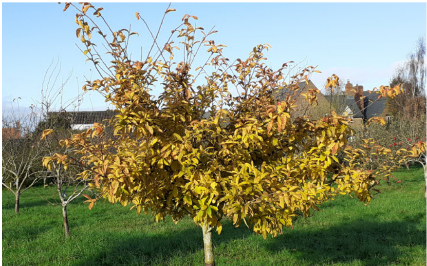
Medlar Apple Tree in Autumn Colours

We continue to gather windfalls and also pick apples from the later varieties. The cider apples are beginning to fall which is the perfect time to gather them up. This is the first year we have had a good crop of Bramley apples, about 75kg so far! The leaves are also falling but enough remain to make it very damp if trying to do any maintenance work. Pruning the fruit trees will start in the new year when hopefully it will be a bit drier and snow free.