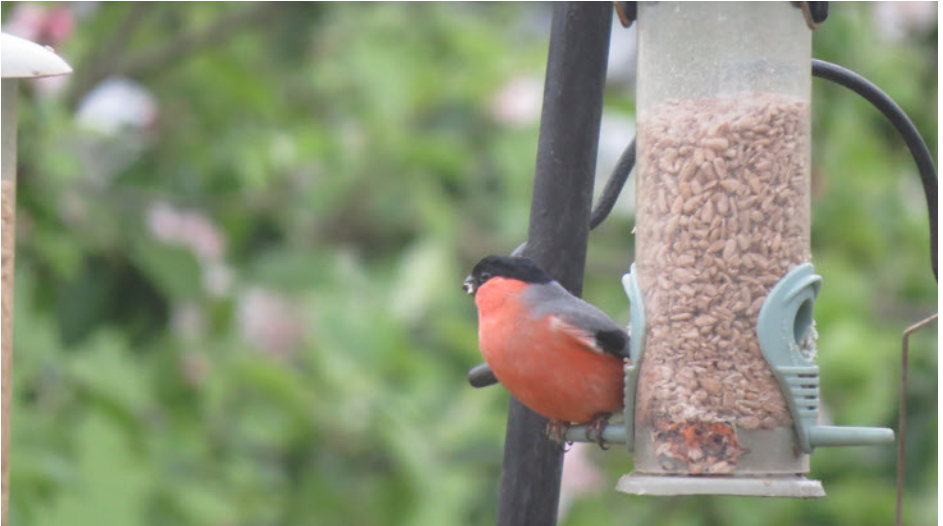
Seen in the Garden