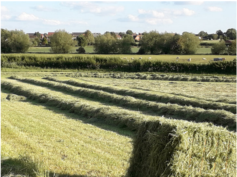
Looking back towards Oxhill from Nolan's Lane