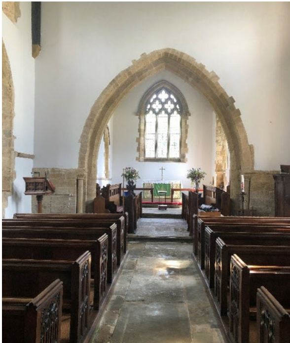
Oxhill's St Lawrence Church

If you would prefer not to join us in church, we entirely understand: most of the time there will also be a Zoomed service available on a Sunday, and the Wednesday Morning Prayer will continue as a Zoomed service.