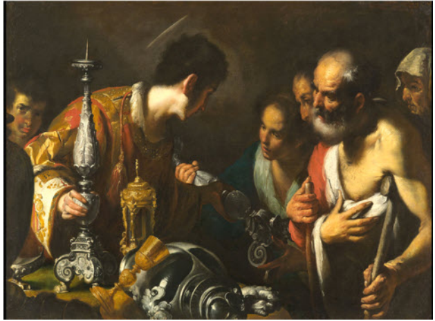
St. Lawrence Distributing the Treasures of the Church by Bernardo Strozzi