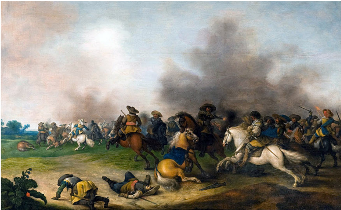
Battle of Edgehill 23rd October 1642 in the English Civil War: by Palamedes Palamedesz