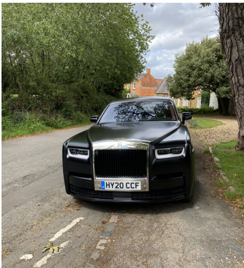
Wedding Roller waiting for the happy couple on Main Street. \sim Val Garland