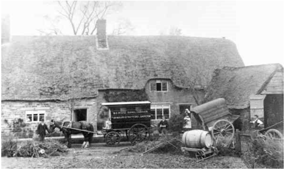
The village carrier c1900