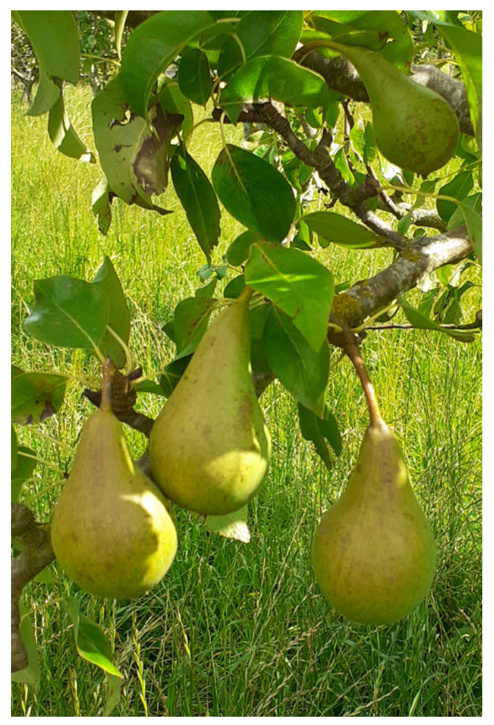
Conference Pears in the WOT2Grow Community Orchard