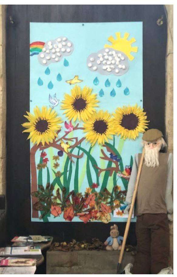
Harvest Collage created by the children

Note that some of the services are reverting back to 9.30 am!